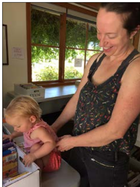
A young mother and her little one are browsing the children's section at one of this summer's monthly book sales.

Sales of books, DVDs, music, etc. helps to raise money to support our library.