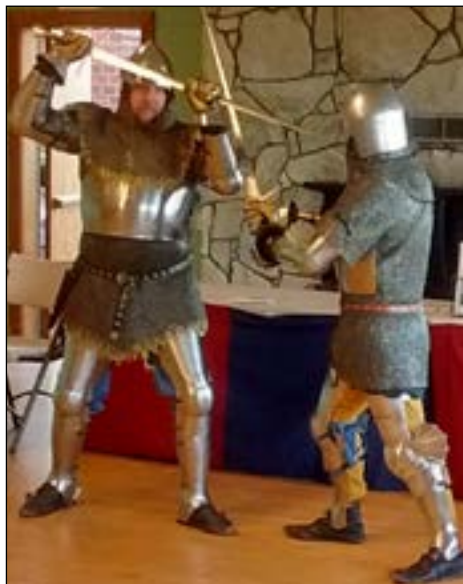
Library staff photo