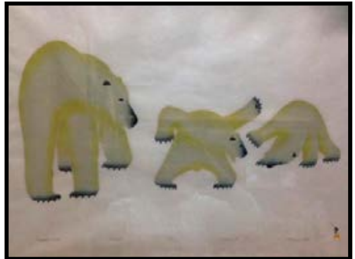
Playful Cubs , Stonecut, 27/50, Dorset 1999, by the artist Kananginak; valued at $1,350

Printmaking was introduced to the Nunavut hamlet of Cape Dorset in the mid-1950s, with the inaugural prints going on sale in early 1960. Since then several other Inuit communities have followed Cape Dorset's example, forming