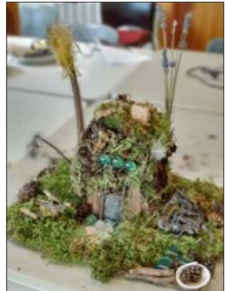
One fairy house ready for occupancy.